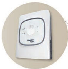
A sample of air is then passed into FAAST FLEX'S detection chamber for analysis.

FAAST FLEX is an aspirating smoke detection system that actively samples the air throughout a facility via an extensive network of pipes with sampling holes. This way, you can detect the early signs of a potential fire threat and take action to prevent disruption and damage to your business.