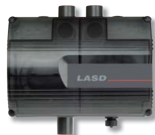
IFT-P, IFT-1 and ILS-2 High sensitive aspirating smoke detectors