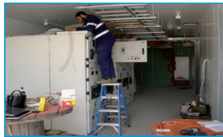
Capillary tubes branch off the main VESDA sampling pipe and into the equipment cabinet, allowing the earliest possible warning of smoke within the cabinet.