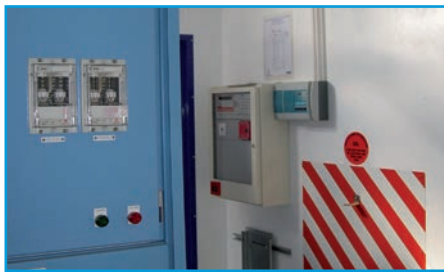
A VESDA detector can be installed inside the portable substation or switchroom whilst it is being built or retrofitted onsite.