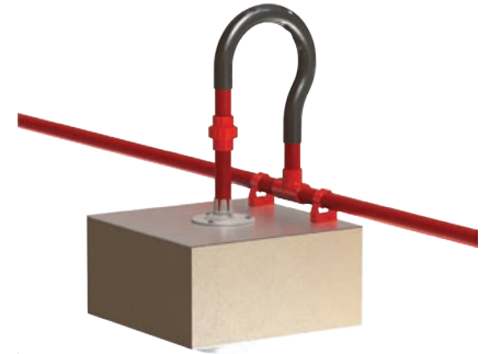
Figure 4: Refrigerated Storage Sampling Kit

The sampling kit consists of an outer and inner parts with ABS plastic sampling pipe, suitable for temperatures down to -40°F (-40°C) penetrating the refrigerated storage sandwich panel (Figure 4).