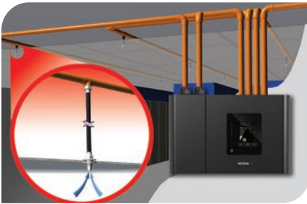
Figure 2: Aggregate Air Sampling