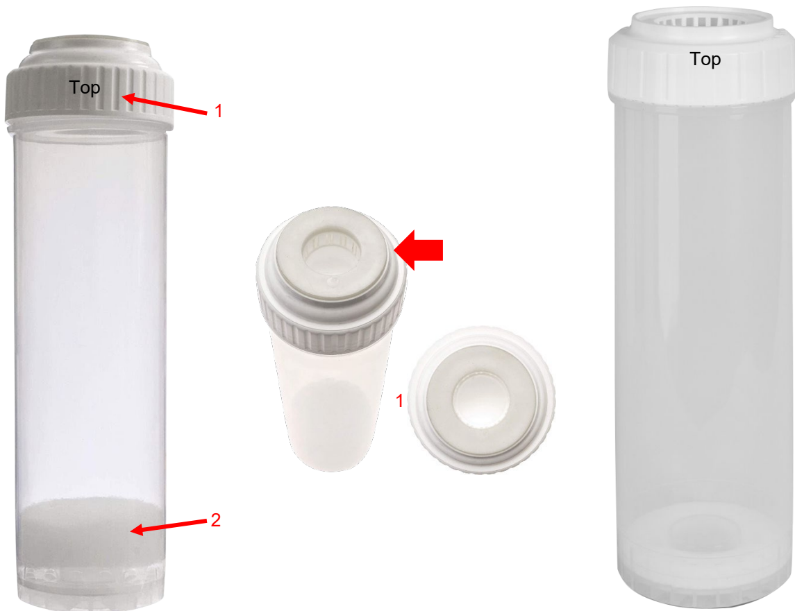
Refillable Cartridge (Original State)