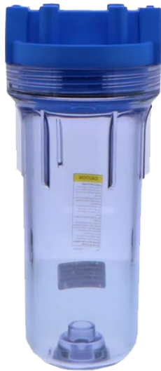
(i) 10" Standard Filter Housing

An example of a chemical filter is shown in Figure 1 assembled from commercially available parts (Table 1) comprising (i) 10" standard filter housing, (ii) refillable cartridge.