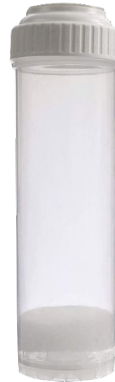
(ii) Refillable Cartridge for 10" Standard Filter Housing