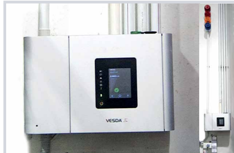
Fig. 1 - VEU in situ in Warehouse

Maintenance was also a consideration for the trial and the VEU was located away from the direct staff working areas in a location that would provide ease of access for the fire maintenance technicians, yet not interrupt warehouse operations.